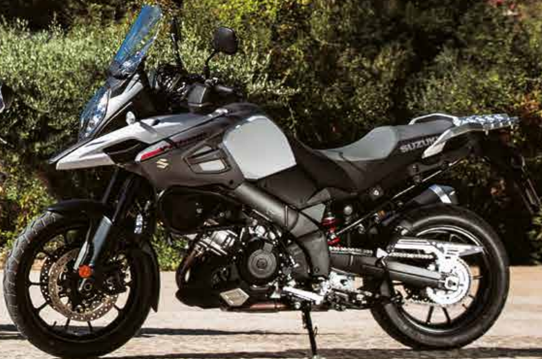
V-Strom 1000 ABS

Leave your daily activities. Throw those commitments into the wind. Sour out into the country, over the mountains, over all borders. The light weight character and punchy engine will Free yourself and Free your wings. Breathe in the fresh air, breathe in the wild nature, Departure on Your Adventure.