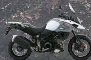
Pearl Glacier White (YWW)