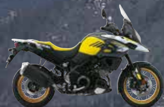
Champion Yellow No.2 (YU1)