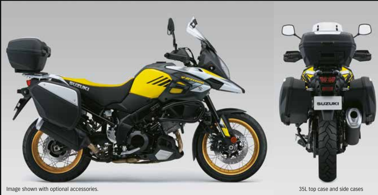
Image shown with optional accessories.