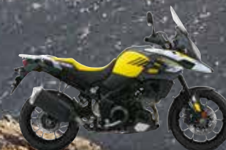
Champion Yellow No.2 (YU1)