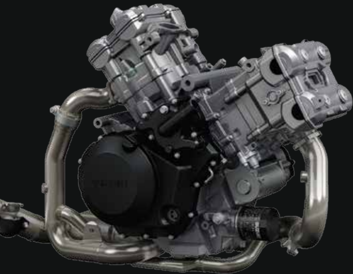
1037cm 3 DOHC, 90-degree V-twin engine

The powerful and versatile 90-degree DOHC V-twin originated as a 996cm 3 unit, and underwent a major rebuild changing various components and rising the capacity to 1037cm 3 in 2014, further maturing this attractive engine to match the demands of a sports adventure tourer. The strong, rider-friendly nature of this V-twin engine gives effortless acceleration irrelevant to the riding situation or the