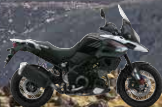
Glass Sparkle Black (YVB)