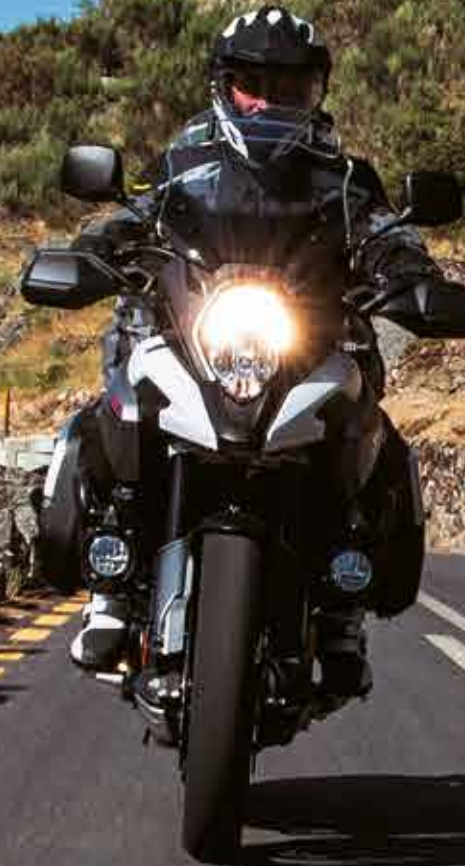
V-Strom 1000 ABS Image shown with optional accessories.