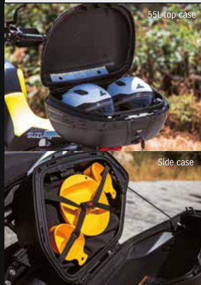
55L top case