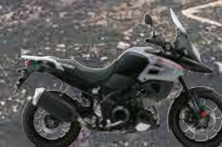
Glass Sparkle Black (YVB)