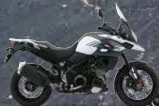
Pearl Glacier White (YWW)