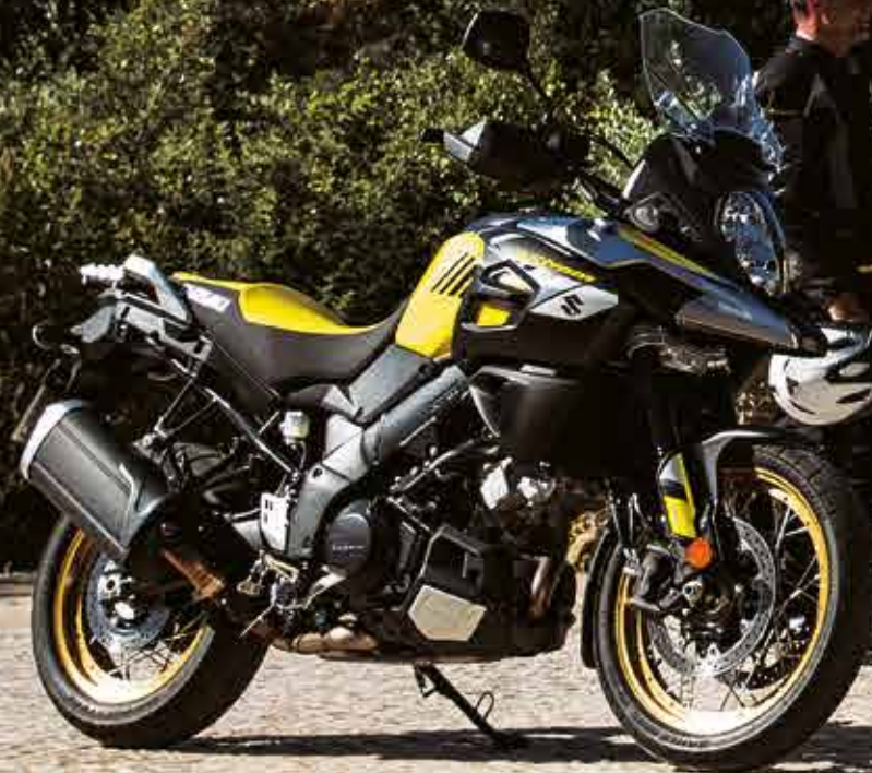
V-Strom 1000XT ABS