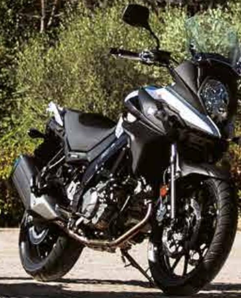
V-Strom 650 ABS