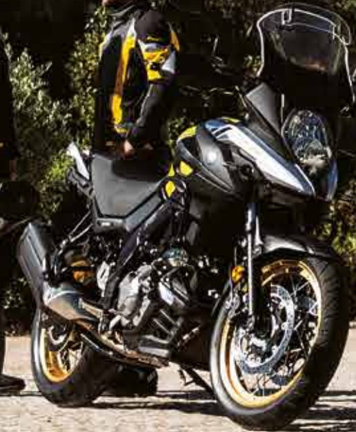
V-Strom 650XT ABS