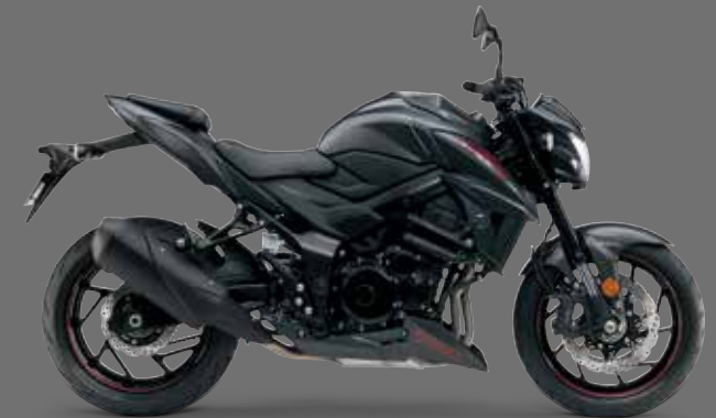
Metallic Mat Black No.2 (YKV)