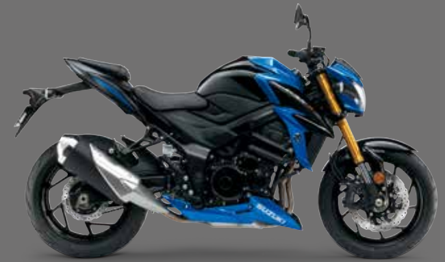
Metallic Triton Blue / Glass Sparkle Black (KEL)