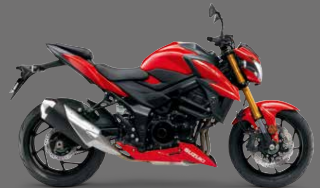
Pearl Mira Red (YVZ)