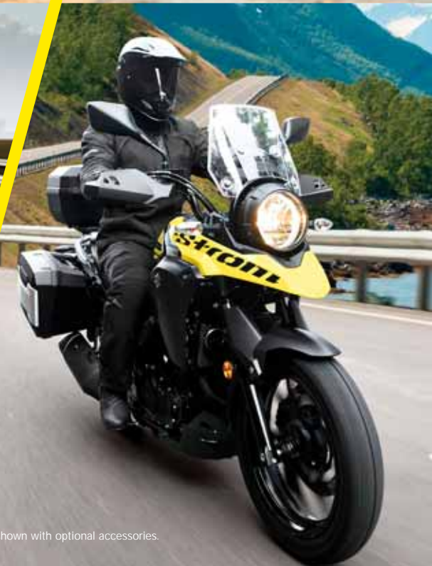
*Image shown with optional accessories.

The instant you take to the road, you sense a change in the breeze and in the air that surrounds you. It's a feeling that makes you want to ride as far as you can for as long as you can, while enjoying the bike's highly emotional styling. The V-Strom 250 ABS is crafted to soundly respond to all these expectations.