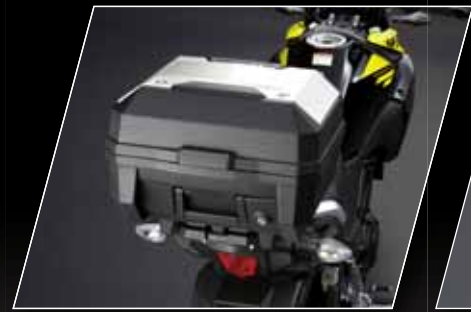
23L top case* 4