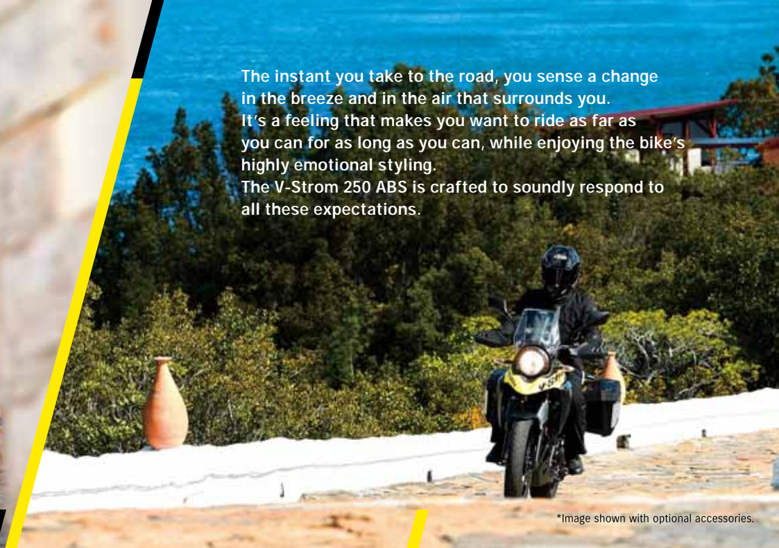
*Image shown with optional accessories.