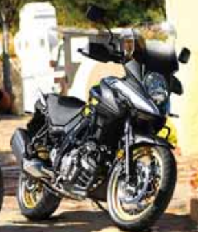
V-Strom 650XT ABS