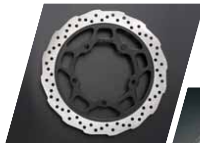
Petal Type Brake Disc