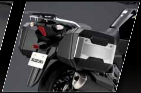
20L side cases* 4