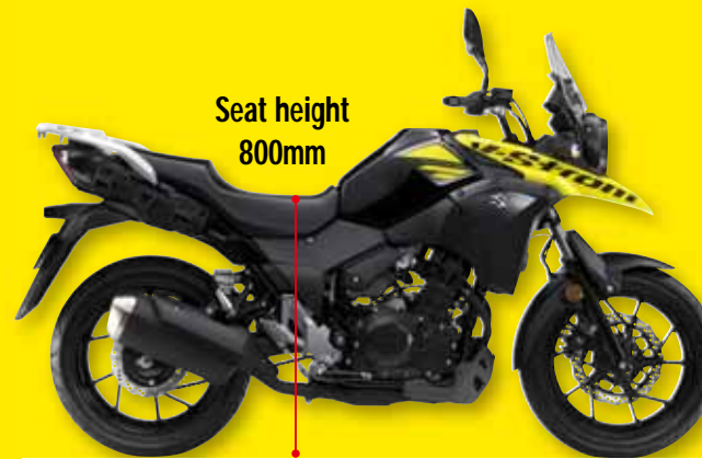
Seat height 800mm

The V-Strom 250 ABS design concept is “Massive and Smart”: Massive for the solid feel of its well-balanced body and Smart for its sophisticated and practical design that provides ease of handling. Naturally, the V-Strom 250 ABS shares the same outdoor adventure DNA as its siblings, with design cues such as its yellow color scheme and unique ‘beak’ paying tribute to Suzuki’s famed DR-Z and DR-BIG desert racers.