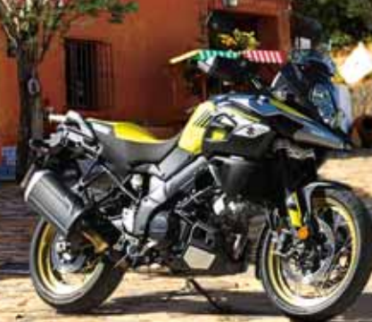
V-Strom 1000XT ABS