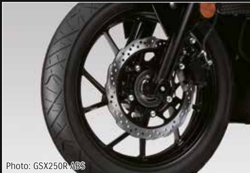
Photo: GSX250R ABS

The GSX250R features a reverse-lit LCD instrument panel. Readouts include the speedometer, tachometer, gear position and RPM indicator, odometer, dual tripmeters, fuel gauge, average fuel consumption and oil change timing indicators, and a clock.