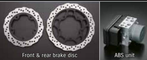
Front & rear brake disc