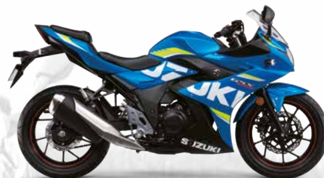
Metallic Triton Blue No.2 (QHV)