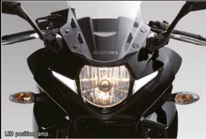
LED position lamp