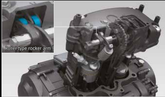
Roller type rocker arm

*2 Calculated based on the Worldwide Motorcycle Test Cycle (WMTC mode) exhaust emissions measuring conditions measured by Suzuki. Actual fuel economy and riding range may differ owing to differences in conditions such as the weather, road, rider behavior and maintenance.