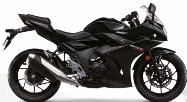
Pearl Nebular Black (YAY)

www.youtube.com /user/GlobalSuzukiChannel