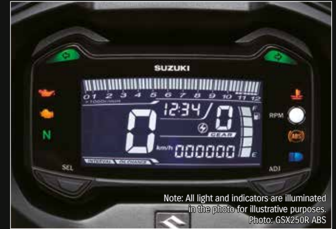
Note: All light and indicators are illuminated in the photo for illustrative purposes. Photo: GSX250R ABS

Enhancing the sporty, aggressive look and futuristic flair of the GSX250R are newly designed surface-emitting LEDs employed by the position lamps up front and the taillight in the rear. Their smooth edge-to-edge illumination and the chevron-like shape that flanks the headlight create a truly distinctive and highly appealing lighting scheme. Adopting clear lenses for the front and rear turn signals adds to the stylish appearance.