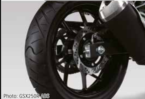
Photo: GSX250R ABS