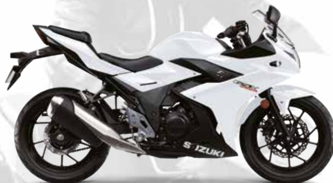
Pearl Glacier White No.2 (QHW)