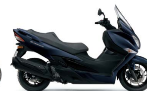
Metallic Mat Stellar Blue (YUA)

Specifications, appearance, colors (including body color), equipment, materials and other aspects of the "SUZUKI" products shown in this catalogue are subject to change by Suzuki at any time without notice, and they may vary depending on local conditions or requirements. Some models are not available in some regions. Each model may be discontinued without notice. Please inquire at your local dealer for details of any such changes.