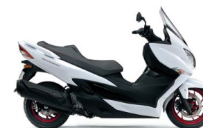
Pearl Glacier White (YWW)