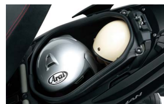
Underseat storage space

■ A slimmer, sharper and sexier design at both the front and rear ends compared to the previous model.