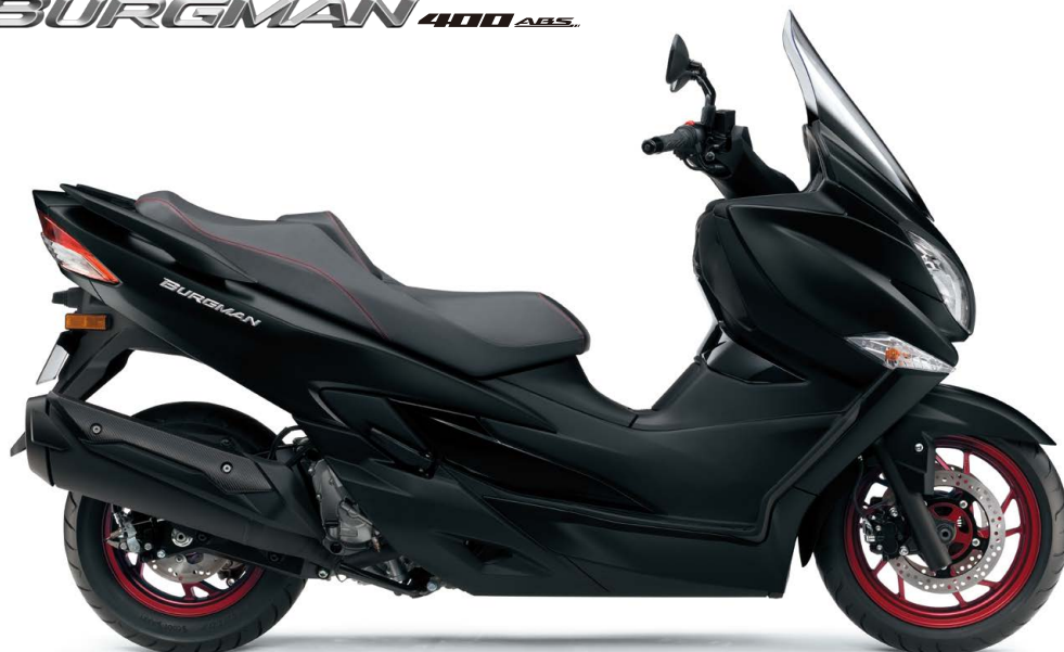
Metallic Mat Black No.2 (YKV)