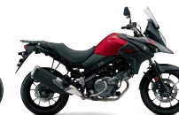
Candy Daring Red (YYG) Photo : DL650A

Specifications, appearance, colors (including body color), equipment, materials and other aspects of the "SUZUKI" products shown in this catalogue are subject to change by Suzuki at any time without notice, and they may vary depending on local conditions or requirements. Some models are not available in some regions. Each model may be discontinued without notice. Please inquire at your local dealer for details of any such changes.