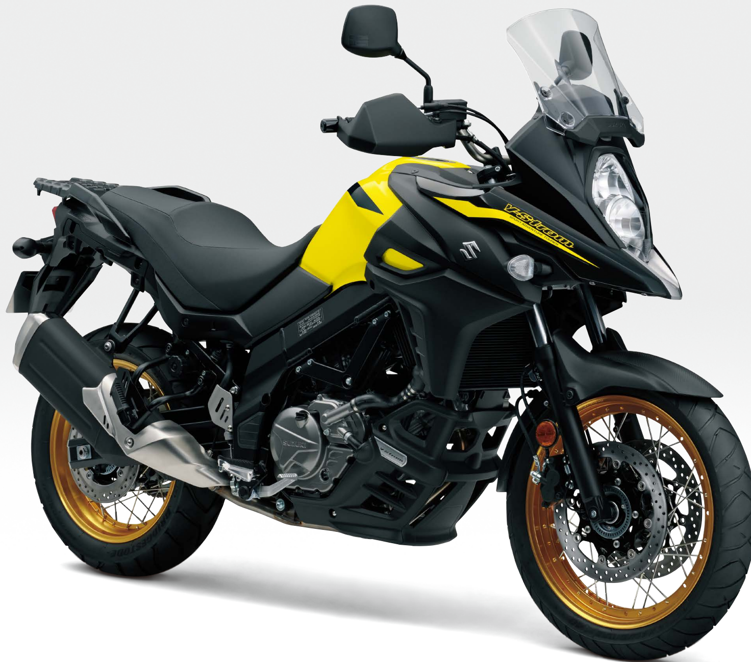
Photo : V-Strom 650XT ABS