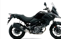
Glass Sparkle Black (YVB) Photo : DL650A