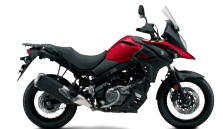
Candy Daring Red (YYG) Photo : DL650XA