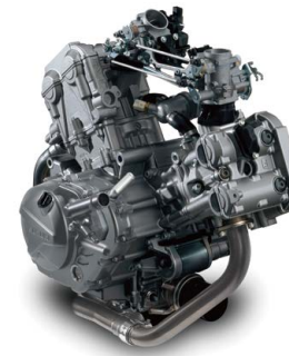
645cm³ DOHC V-twin engine