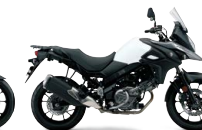
Pearl Glacier White (YWW) Photo : DL650A