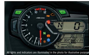
Multi-functional instrument panel