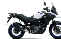
Pearl Glacier White (YWW) Photo : DL650XA