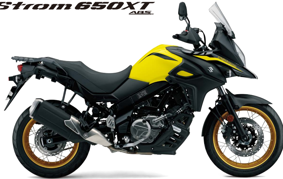
Champion Yellow No.2 (YU1)