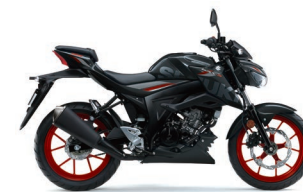
Titan Black (YVU)

Specifications, appearance, colors (including body color), equipment, materials and other aspects of the "SUZUKI" products shown in this catalogue are subject to change by Suzuki at any time without notice, and they may vary depending on local conditions or requirements. Some models are not available in some regions. Each model may be discontinued without notice.