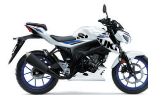
Brilliant White (YUH)