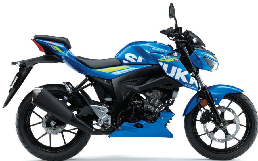
Metallic Triton Blue (YSF)